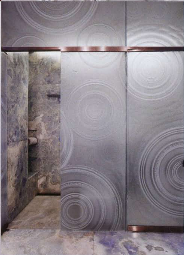
Clockwise from top left: The dressing room's Jasper Morrison desk is a limited edition. Wheel-cut frosted glass fronts the shower. Stainless steel borders the panels. Door frames in the dressing room are painted wood.